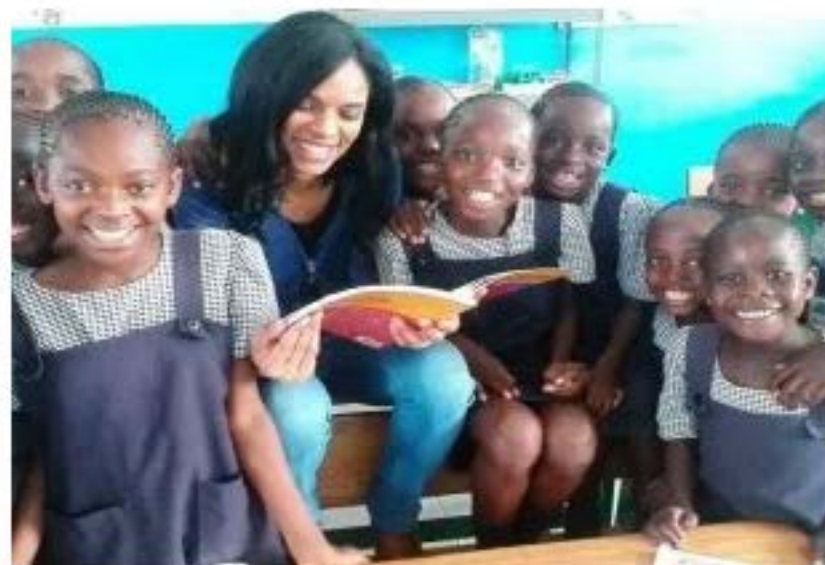
The Malaika school provides free education to 230 girls.